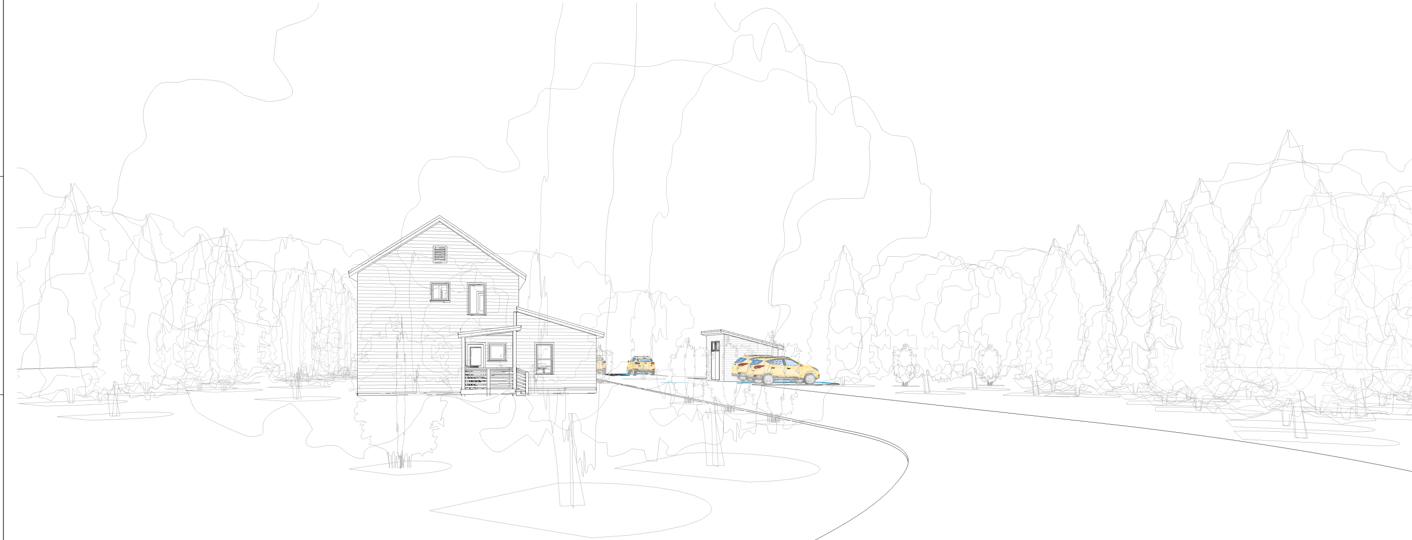
J1 ACCESS ROAD A-1.0