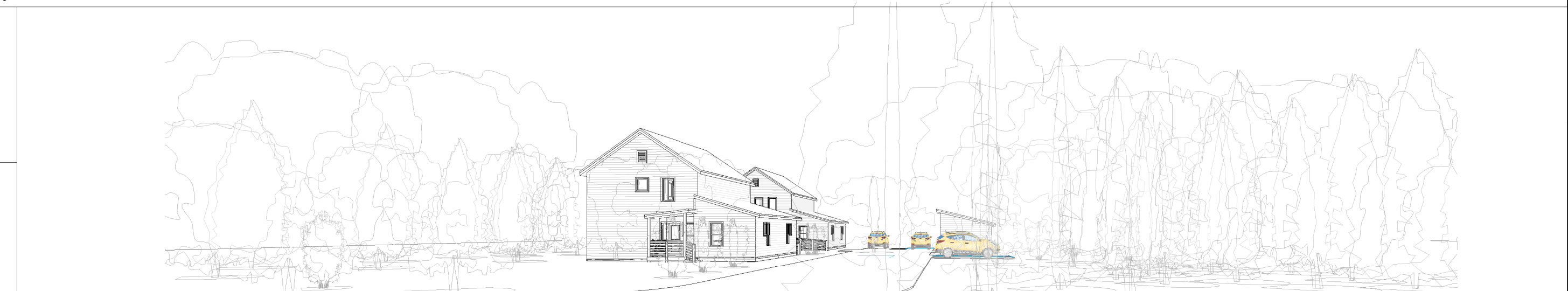
H8 VIEW 2 A-1.0