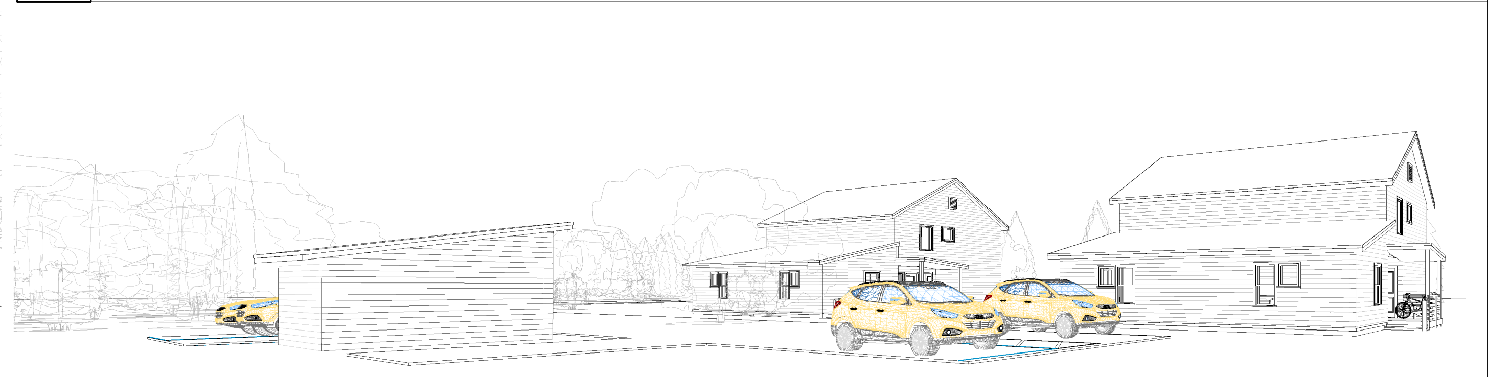
J8 VIEW 3 A-1.0